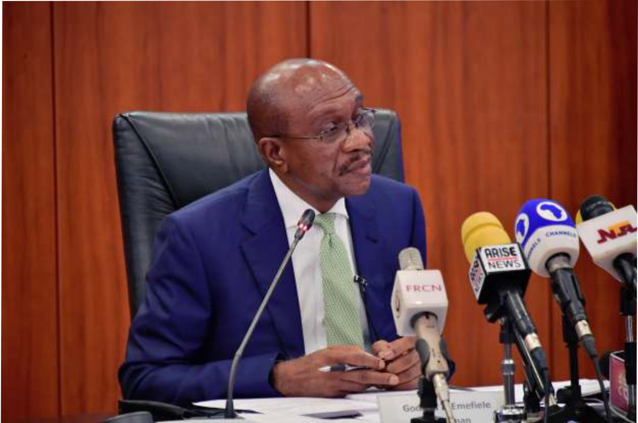
Mr. Godwin Emefiele Governor, CBN

F or the first time in almost 2 years, the Central Bank of Nigeria's (CBN) Monetary Policy Committee (MPC) at its third meeting of the year raised the interest rate from 11.5 per cent to 13 per cent.