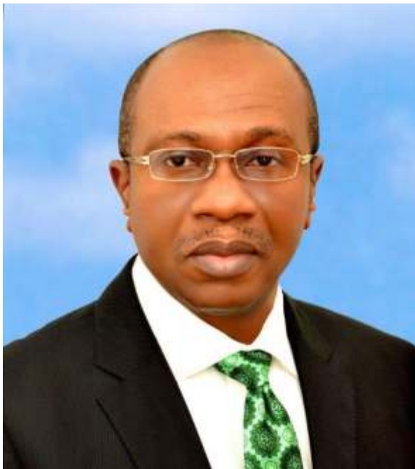
Mr. Godwin Emefiele Governor, CBN

T he Governor, Central Bank of Nigeria (CBN), Mr. Godwin Emefiele, has expressed optimism that the Bank will achieve the 85% financial inclusion rate target in Nigeria, within a very short period from its current rate of slightly below 70%.